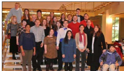
Taking Cutting Edge friends to Sister Act