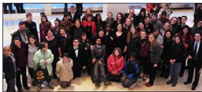
Best Buddies going to see Mary Poppins