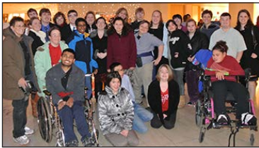
Taking friends to Beauty and The Beast