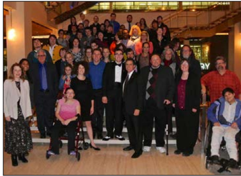
Taking friends and mentors to Joseph and the Amazing Technicolor Dreamcoat