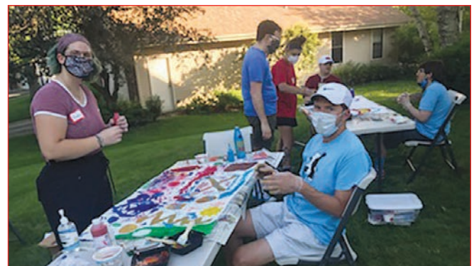
AHTAFI helped sponsor an IHM workshop this summer. We were able to spend creative time together outside in a safe way.

We look forward to all that is ahead because we know that the arts will return with a resurgence of hope and creativity because of the time of fallow ground. Come join us in preparing for this season. We have on deck the possibility of taking students to Peter Pan with CTM this year and we will see other opportunities as they come forward.