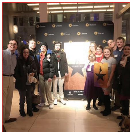
Hamilton was an impacting event for all. It surely changed lives of those attending.