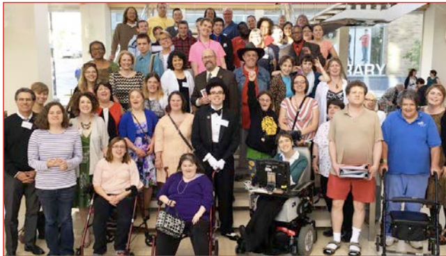
We took Art Working artists, Cutting-Edge students, Middleton High School Transition classes, and individuals from the organization LOV-Dane on three different evenings. What an experience for all!!

Our premier theater experience of 2016 was taking over 150 individuals with disabilities, along with their mentors, to see The Lion King at the Overture Center for the Arts. I'm not sure what captivated our audience the most. The music? The story? Seeing the animal characters such as the elephants, the lions and the gazelles come to life? Perhaps it was the vivid colors and dramatic stage creations? Most certainly the story gripped everyone in their heart and had us both laughing and moved to tears. But the highlights continued after the show because one of the dancers from The Lion King , who performed a number