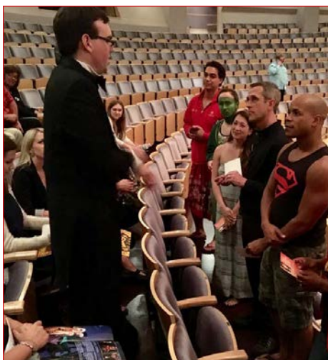
The cast stayed late answering questions and encouraging us.